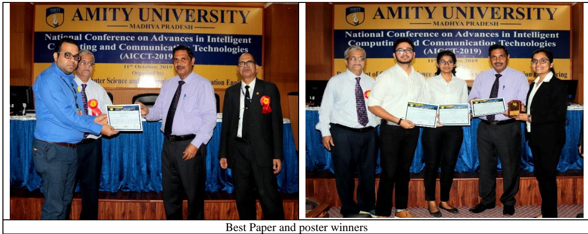
Best Paper and poster winners