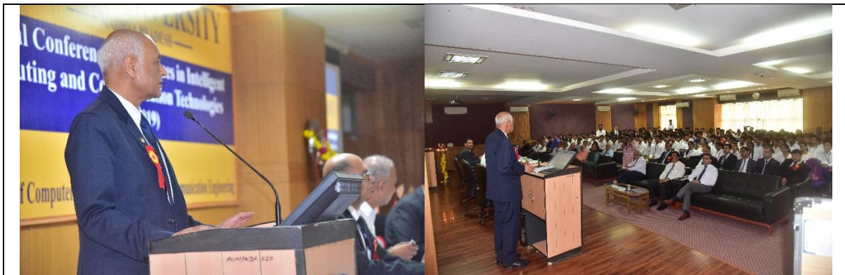
Opening Remark by Hon'ble Vice Chancellor Lt Gen VK Sharma, AVSM (Retd.)

batteries, wireless charging, best scattered radiation, drug delivery system by intelligent system and disease detection by only scanning the eye only. The rapid proliferation of mobile phones has bridged the communication divide across geographical locations. It has empowered people and opened new opportunities, access, and possibilities few could have imagined just a decade ago. Many conventional services like banking, education, marketing, television and routine transaction payments have now converged onto a mobile screen. Startups and developers across the emerging markets are already building Mobile services and bringing the applications to the palm of users. However, the security of networks remains a challenge particularly when we take a holistic look to include the security of not only networks, but software, applications and most importantly, the data.